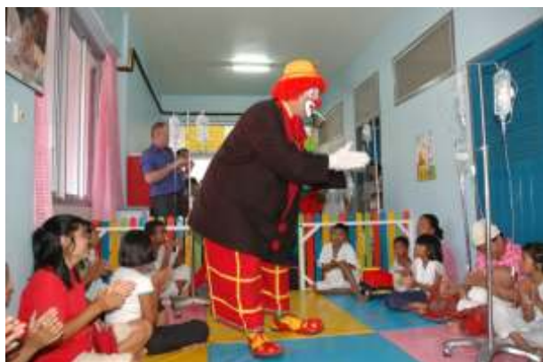
At Wachirah Hospital

Together with two French association, our Club organised a week of "Smile and Care" activity for the children in Phuket and Kao Lak from 05.02.05 till 09.02.05. Our team was made of 3 members of the GSCF, 3 members of the ANIMA association, and Lions Club members.