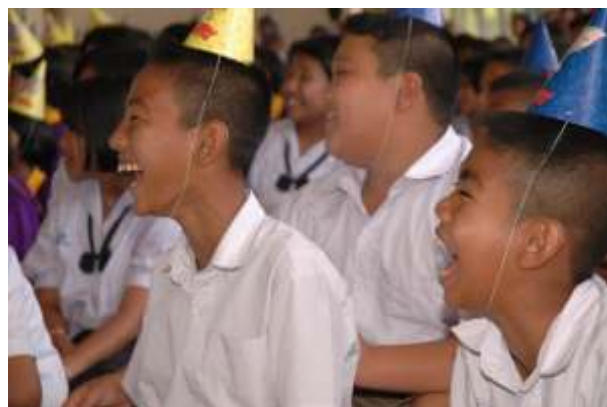
Happy laughing children everywhere

We then went on to Phuket Special School in Baan Pakhlok, where handicapped children are being taken care of. The school is the only place for all kinds of handicapped children to go to, from deaf or blind children to Autistic and Down's Syndrome children.