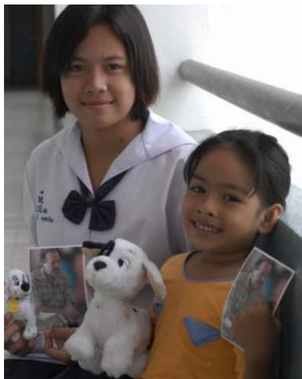
Students with a photo from their Sponsor