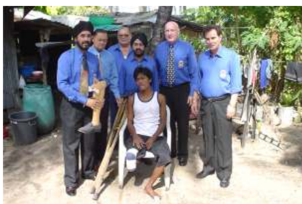
Supporting the Disabled