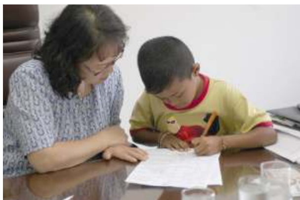
Setting up a bank account

In order to provide immediate relief for children who have lost members of their families, their home or any kind of income, we have just started a new project. We are financially helping those families who are in the most desperate situation. This project is meant to be a short term (one year) solution. We are closely monitoring the financial and social situation of these children for the next year and then reevaluate their status to decide whether they still need financial support or not.