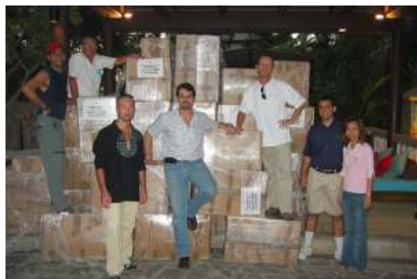
More than 1000 KG of goods

Arriving on Saturday the 5th of February at Phuket airport with over 1 ton of toys and medicine, the team went straight to visit Children at Patong Hospital and Vachira Hospital in Phuket Town. On Sunday, the team started an exhausting but fantastic joy-bringing tour of Kao Lak refugee camps and schools. Over the next 3 days over 2000 children in 10 different locations, laughed, smiled and received toys and medical care from our multi-task crew.