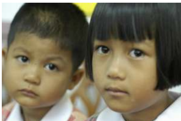
Two children who just found a sponsor

As many organisations (including us) have planned projects in the effected areas, it is very hard to tell what the future of all these affected children might be like. This project is not only for Tsunami victims but for all children that need help. But we can certainly identify Tsunami victims, if you wish it.