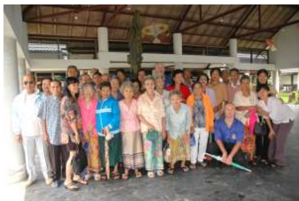
Entertaining the Elderly

The Lions Club Andaman Sea hereby states: